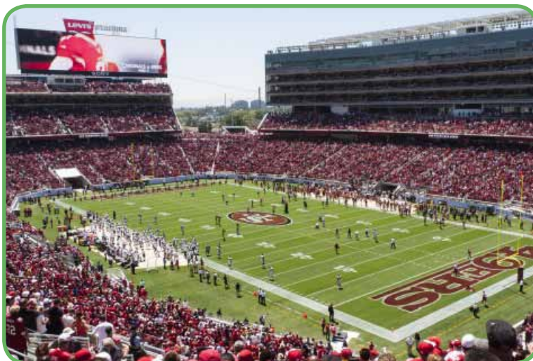
49ers and fans enjoying their first season at Levi's Stadium.