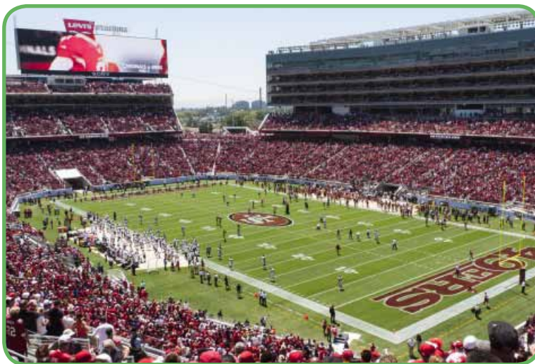
49ers and fans enjoying their first season at Levi's Stadium.