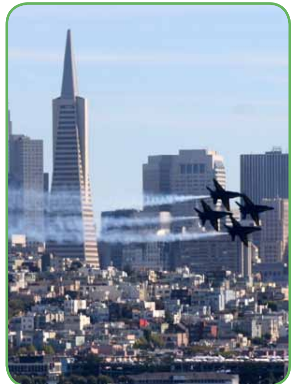
Fleet Week in October featured the Blue Angels and Parade of US Navy Ships.